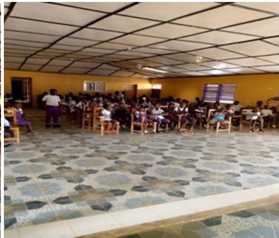
Above– Students and Staff at Weekly Chapel Service