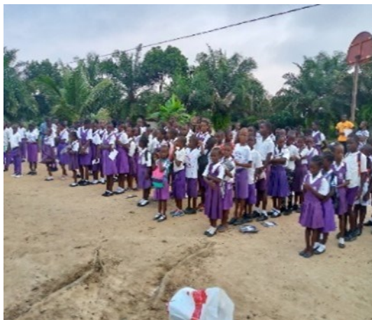
Left-Students and Staff Daily Devotions before class.