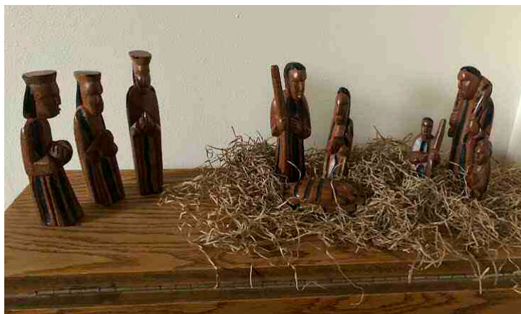
Nativity set hand-crafted in Liberia