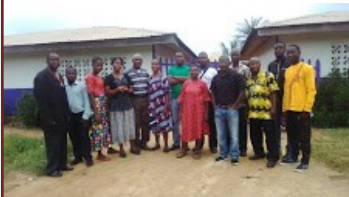
The Parent Teacher Organization