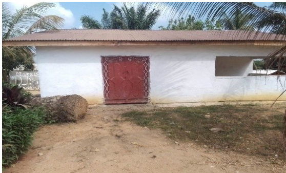
Newly Constructed Cafeteria

Second, our long-time dream and prayer to provide meal for the students and staff is being answered. Below are photos of the progress we've made with help of the "World Food Program (WFP). Meals will be served three days a week. The Administration will need additional funds to purchase additional utensils, and ingredients. Also to provide stipends for the two volunteer cooks. The WFP does not cover those expenses.