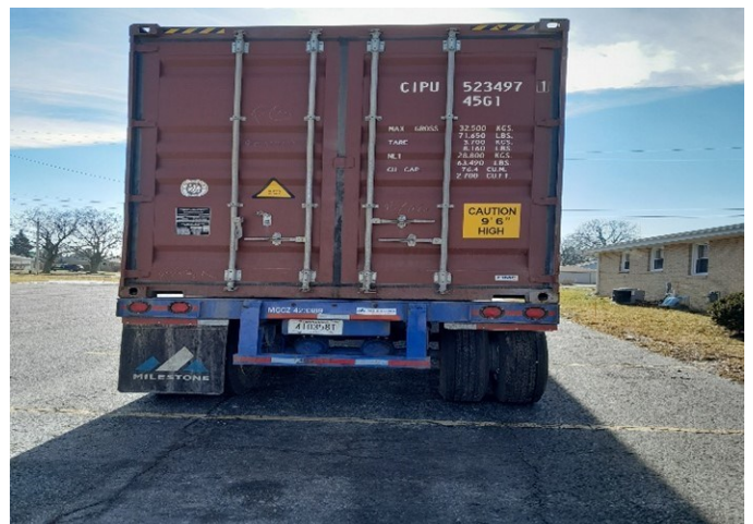
40 foot cargo container on the road to Liberia!